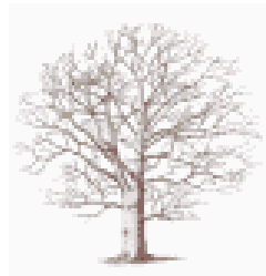
The Family Tree